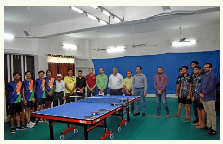
A Glimpse of Table Tennis