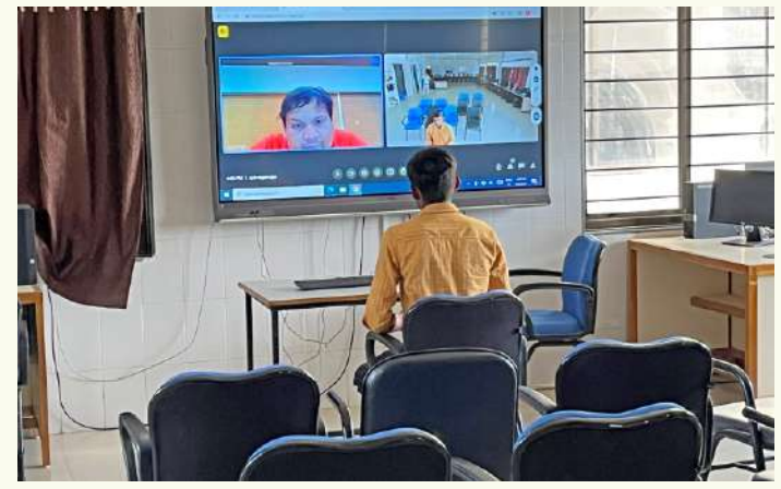
Student giving Personal Interview via Video Conferencing at CoA, Mota Bhandariya for Growit India Pvt. Ltd.