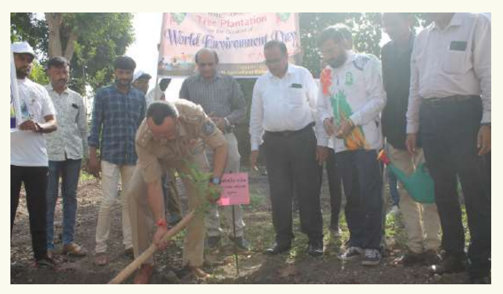
Dy. S.P., Junagadh planting the sapling