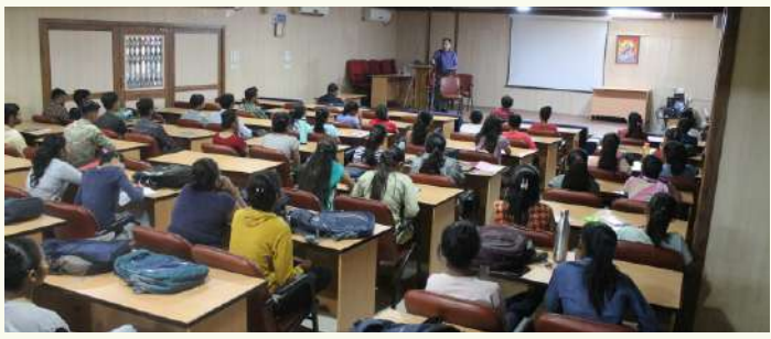
Students attending the Training Programme on Campus to Corporate