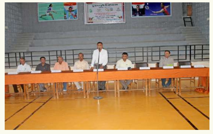
Inaugural Function of Inter-college Sports Tournament 2022-23