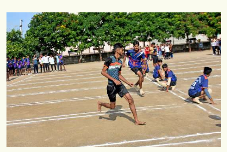
Participation of Students in Kho-Kho