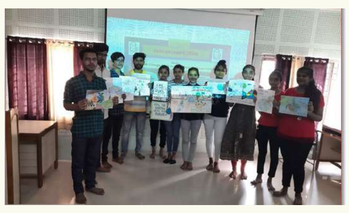
Slogan Writing Competition