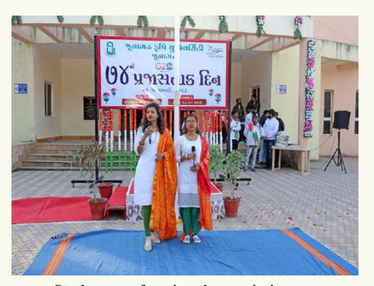
Students performing the patriotic song