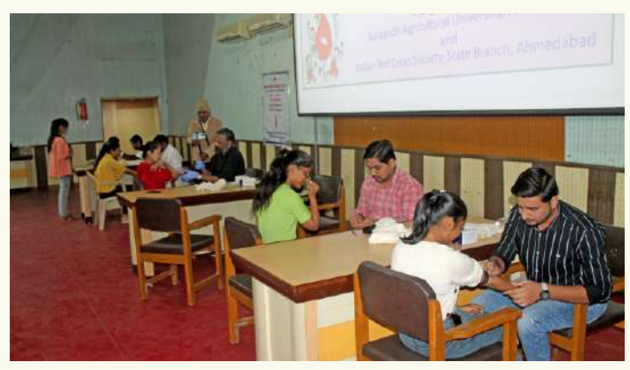
Collecting blood samples of students for Thalassemia Test