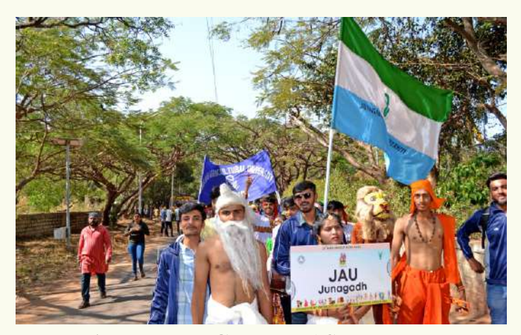
Glimpses of Team sent for All India Ag. Univ. Youth Festival, held at GKVK, UAS, Bangalore, (Karnataka)