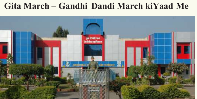
College of Agricultural Engineering and Technology, Junagadh