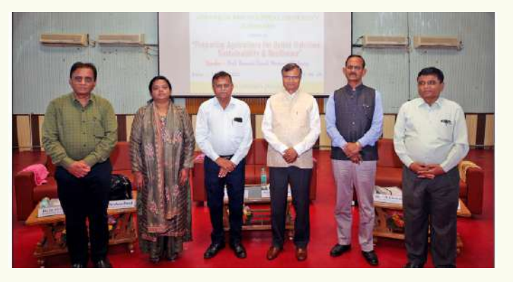
Visit of NITI Aayog members in the University