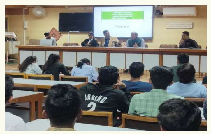
Orientation Programme at CAET, Junagadh by Bhoomi Agro