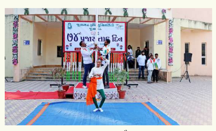
Students participating in 75th Independence Day