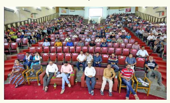
Students & Staff attending lecture on National technology Day