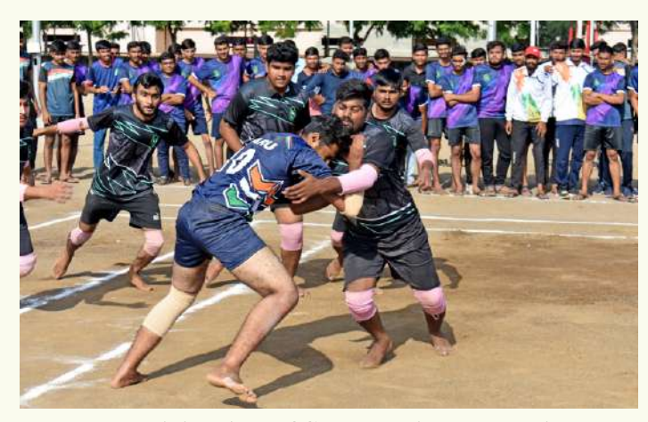
Participation of Students in Kabaddi