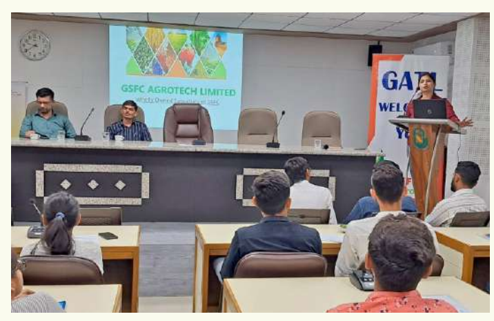
Orientation Programme at CoA, Junagadh by GATL, Vadodara