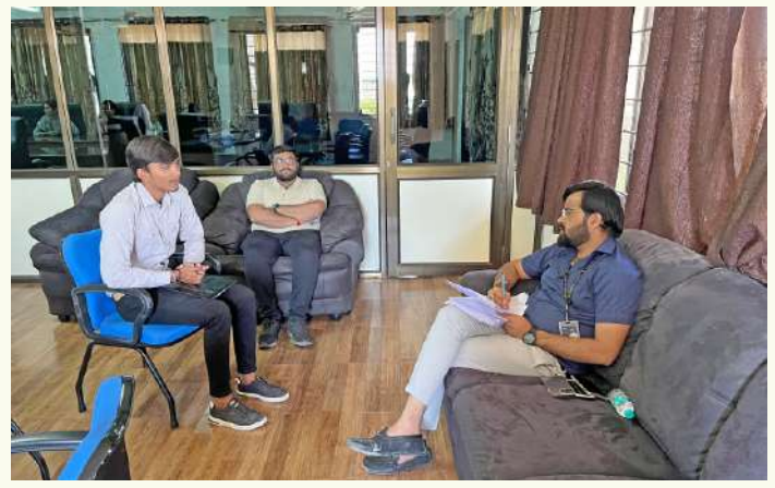
Student giving Personal Interview at CoA, Mota Bhandariya for Rupiya Finnovations, Ahmedabad