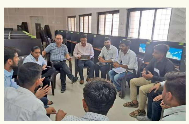
Students participating in Group Discussion held by Gharda Chemical Ltd.