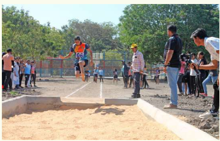
Students participating in Inter-college & Inter-polytechnic Long Jump Competition