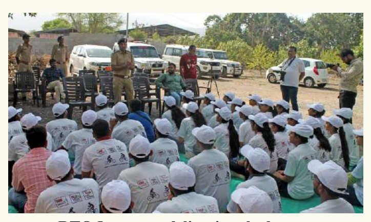
RTO Inspector delivering the lecture