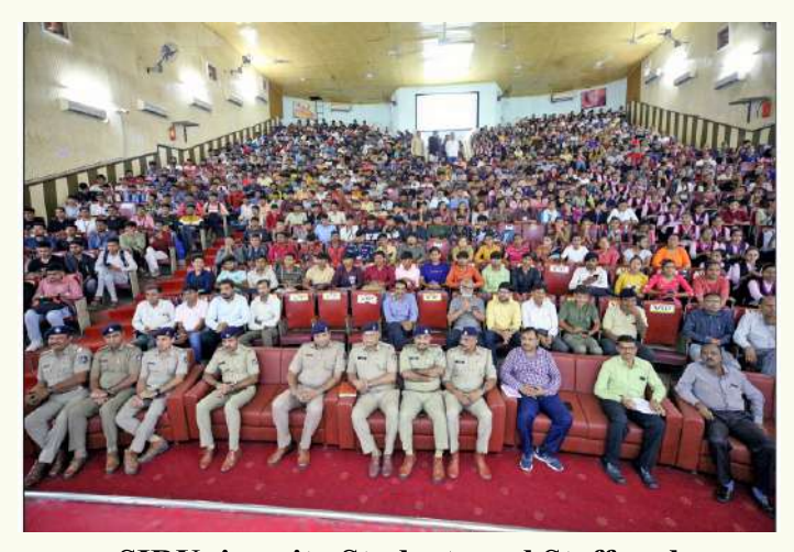
SIRUniversity Students and Staff and Police Staff attending the programme