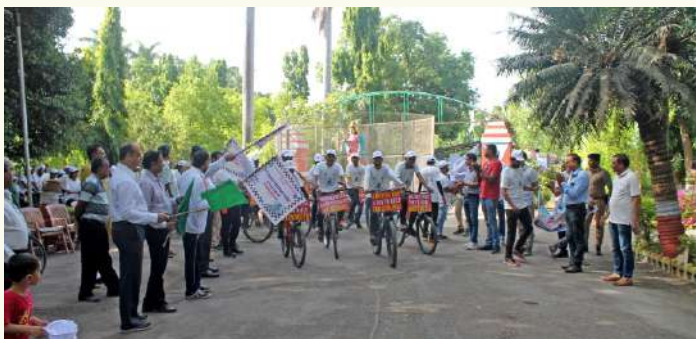
Flag-off for Fit India Freedom Rider Cycle Rally held at JAU Campus, Junagadh