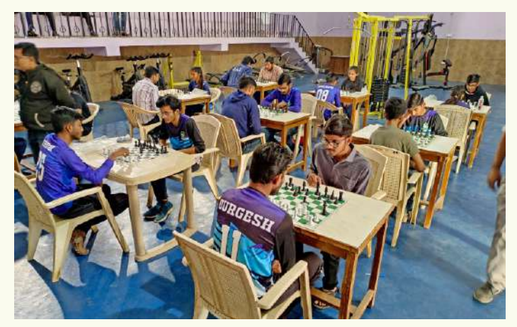
Participation of Students in Chess