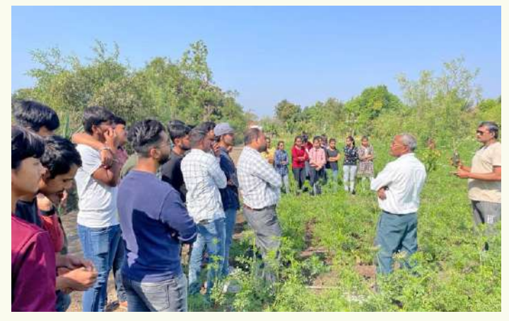
Farmers' Field Visit