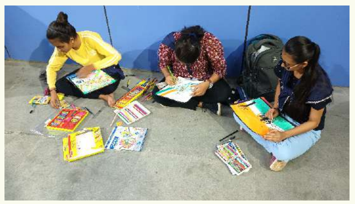
Students participating in different competitions held in NSS Zonal Level Workshop